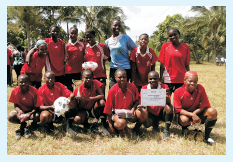
MTG open age team won the 2015 Annual MTG Club Tournament played at Kakanjuni community field. It was the first time that MTG United won the title in the MTG tournament taking over the title from 2013 and 2014 winner St. John's Secondary School.