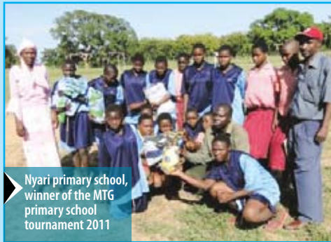
Nyari primary school, winner of the MTG primary school tournament 2011

The primary school tournament, the MTG tournament and the Champions league all gave us new champions in 2011. And we are extremely proud of MTG's of our MTG World Champion!