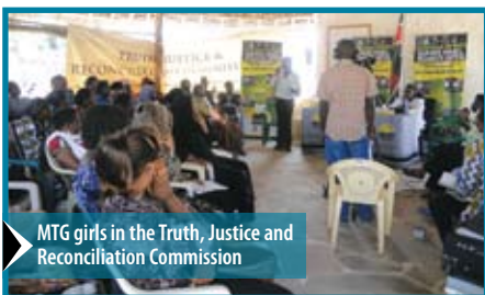
MTG girls in the Truth, Justice and Reconciliation Commission

The Truth, Justice and Reconciliation Commission, that promotes peace, justice, national unity, healing and reconciliation among the people in Kenya, held one of its public hearings for women at MTG's premises. Selected witnesses had an opportunity to speak on a broad range of violations and events. MTG's health coordinator was one of the selected witnesses. She spoke about the violation of rights of the girls in Kilifi. ☺☺