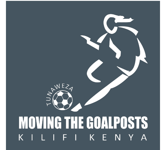
MTG PRIMARY WHITE LOGO