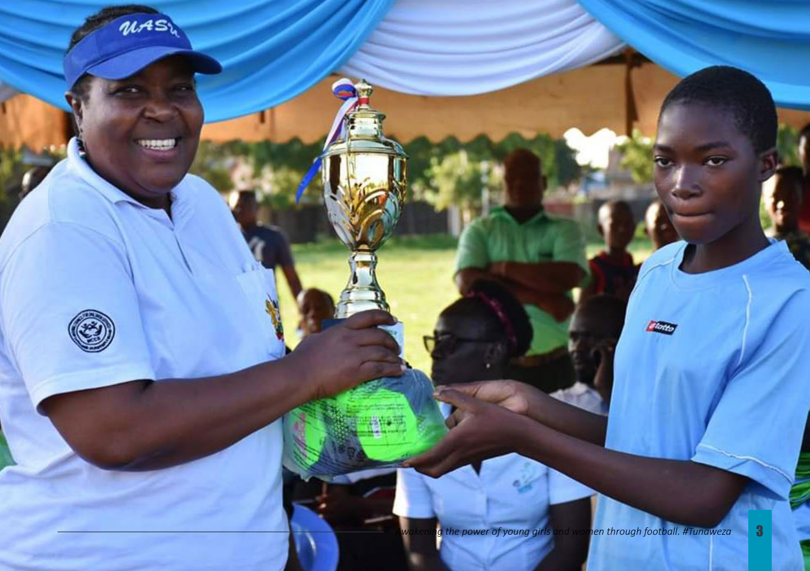
wakening the power of young girls and women through football. #Tunaweza